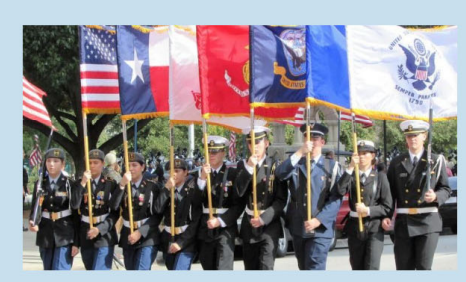
WE ARE ONE POWERFUL FORCE UNITED TOGETHER

THROUGH ADVOCACY AND EDUCATION FOR THE IMPROVED QUALITY-OF-LIFE AND ECONOMIC FAIRNESS TO SUPPORT THE WELL-BEING OF MILITARY SERVICE MEMBERS AND THEIR FAMILIES | ONE POWERFUL FORCE UNITED TOGETHER